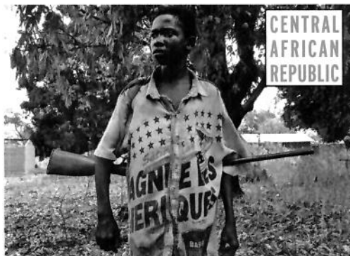
CENTRAL AFRICAN REPUBLIC